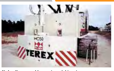
Hydraulic removable counterweight system